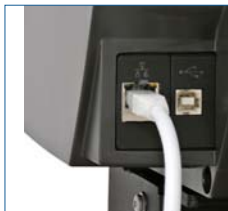
Fastest bandwidth in the industry w/ Gb Ethernet and xDTR2