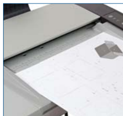
Support your documents with paper feed guides