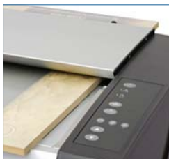
Scan thick originals with automatic thickness control (ATAC)