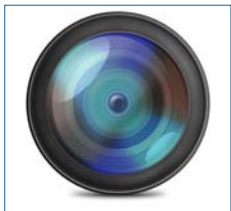
Contex CCD with ALE ensures precision of 0.1% accuracy

HD Ultra scanners are for customers who require a high throughput of documents, great flexibility and unmatched performance.