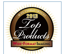
Contex HD Ultra awarded Best Wide Format Scanner for second consecutive year