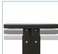
Height adjustable stand for optimal ergonomics

Contex Head Office Phone: +45 4814 1122 info@contex.com