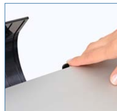
Easily adjust paper pressure to protect fragile documents